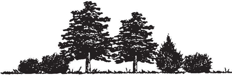
Figure 2: Ladder fuels enable fire to travel from the ground surface into shrubs and then into the tree canopy.